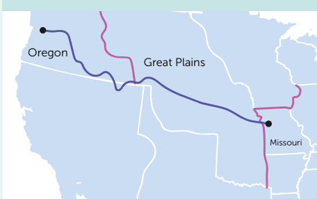
Map showing the Oregon Trail.

The volume of traffic crossing the Permanent Indian Frontier and across Native American land in the Great Plains resulted in increased hostility from some of the Plains Indians towards white Americans.