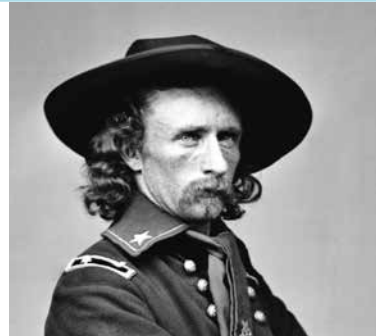
General George Custer

In 1874, General George Custer and his men were sent to protect railroad workers who were building a railway near Sioux land in South Dakota. While there, Custer and his men discovered gold in the Black Hills. The US government offered to buy the Black Hills from the Sioux, who had been granted a large reservation as part of the second Fort Laramie Treaty (see page 37 ). The Sioux refused because the Black Hills were sacred, and many Sioux began to leave the reservation and gather together. The US army ordered the Sioux to disband and return to the reservation, but the Sioux refused, and by early 1876, approximately 10,000 Native Americans led by Crazy Horse and Sitting Bull (see page 35 ) were camped at Little Bighorn River and were prepared for battle.